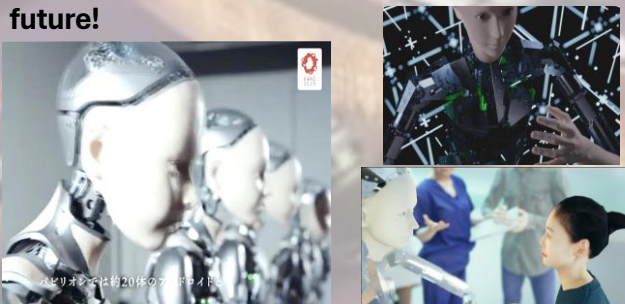
Signature Pavilion 'Future of Life'

To what extent will human-like androids expand human potential? You can experience life in the future surrounded by robots 50 years from now. You might be able to meet humans from 1000 years in the future!