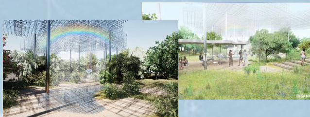
Signature Pavilion 'Better Co-Being'

This pavilion has no roof or wall. Visitors can experience a variety of resonances, including an installation in which they create a rainbow together with nature, which changes with the seasons, weather, and time of day, while resonating with each other!